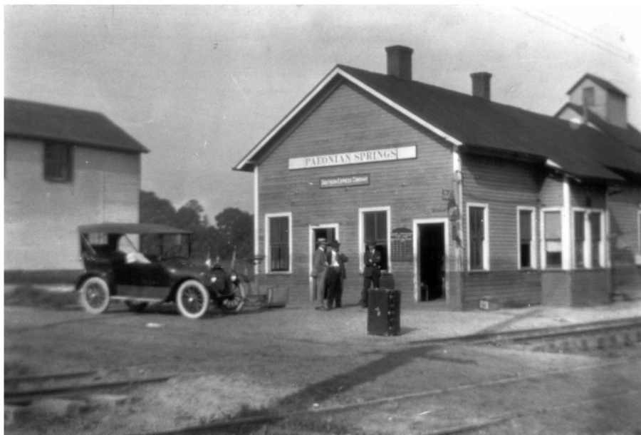
Original Paeonian Springs Train Station